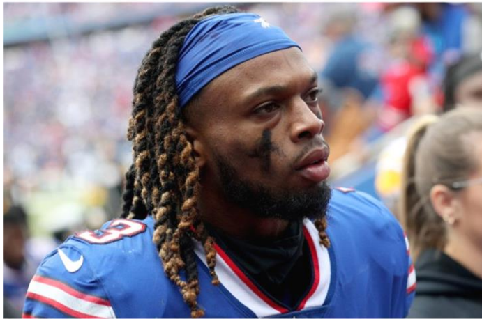
1Photo From Newsweek.com

(Continued from page 6) If you are a fan of professional football you probably remember and perhaps were even watching the Monday night match-up between the Buffalo Bills and the Cincinnati Bengals in January 2023. About half way through the first quarter a Bengal's receiver caught a pass and was tackled by Bill's safety Damar Hamlin. Hamlin fell to the turf, got up for a couple of seconds, and then collapsed. We are used to seeing football players get injured and often require medical treatment on the field and are then carted off for further examination and treatment. But this seemed different-a sense of foreboding and deep concern on the playing field. Players wandering aimlessly, crying, praying, and the Bill's training staff were working feverishly, administering CPR to Hamlin.